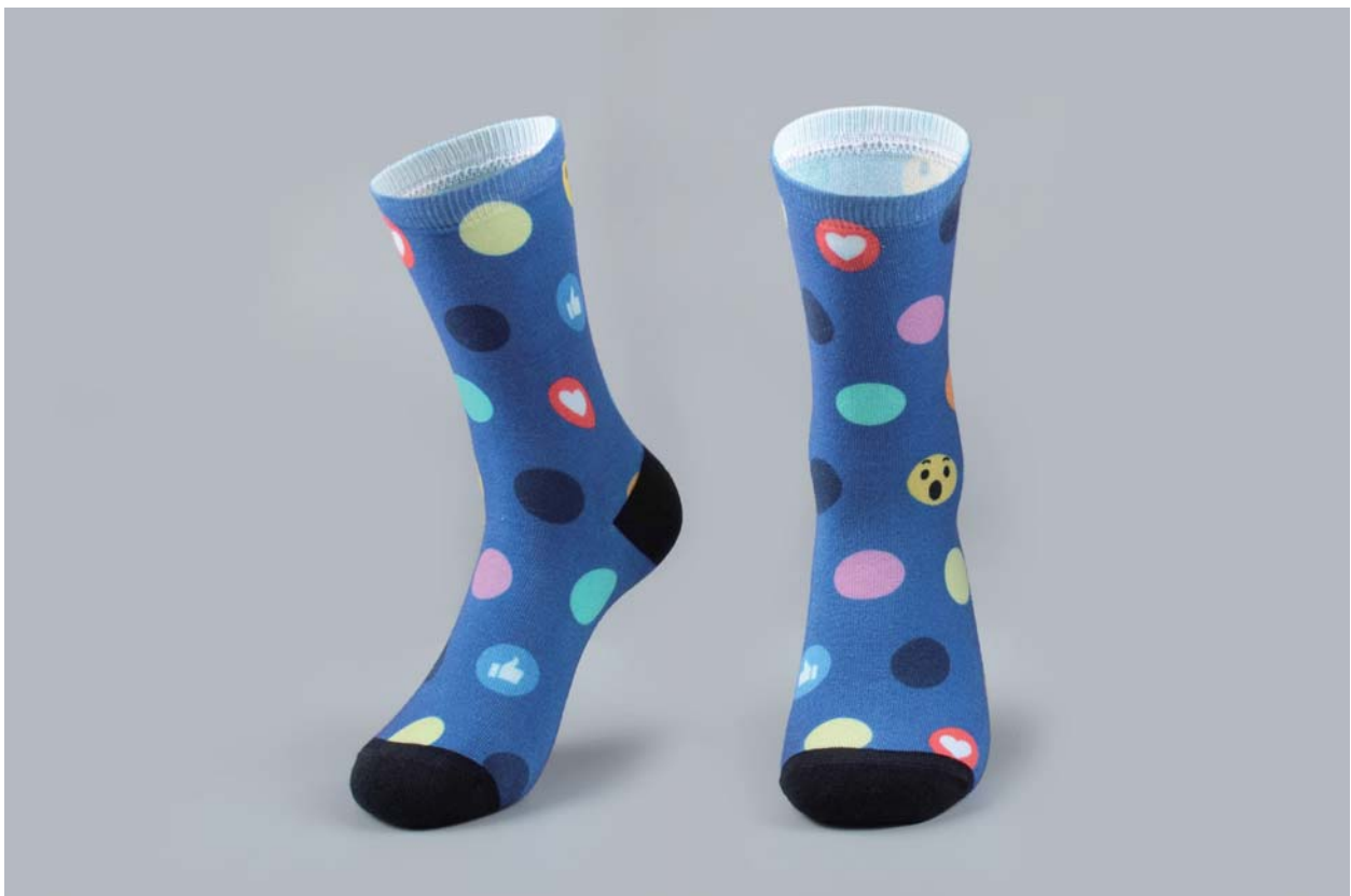
HJF-3623 3D Digital Print Crew Socks

80% Cotton, 18% Nylon, 2% Elastane With 3D print all over 3 Size from S, M, L Min. qty from 250 pairs Production time: 25 days