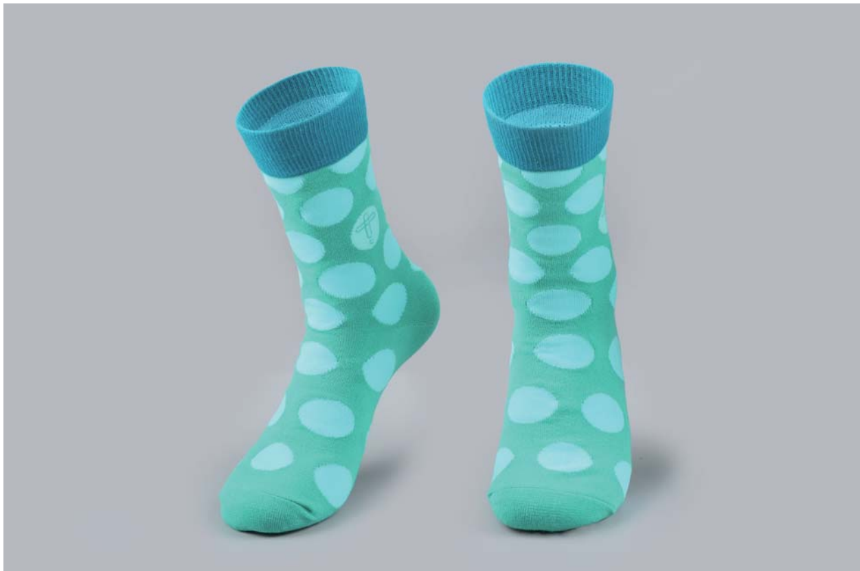
DRA-2205 All Over Jacquard Crew Socks

80% Cotton, 18% Nylon, 2% Elastane With all over jacquard logo design 3 Size from S, M, L In own custom color and design Min. qty from 250 pairs Production time: 25 days