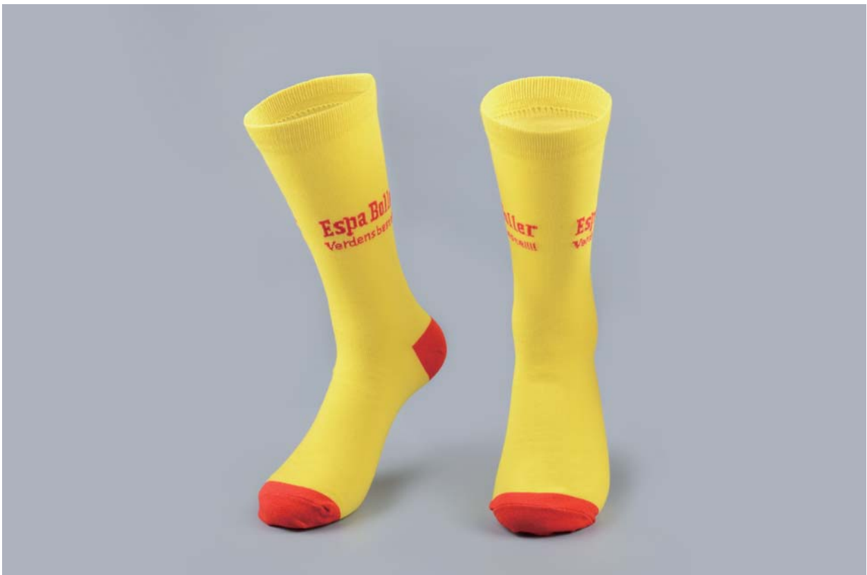
HJF-3080 Basic Crew Socks

80% Cotton, 18% Nylon, 2% Elastane With jacquard logo 3 Size from S, M, L In own custom color and design Min. qty from 250 pairs Production time: 25 days