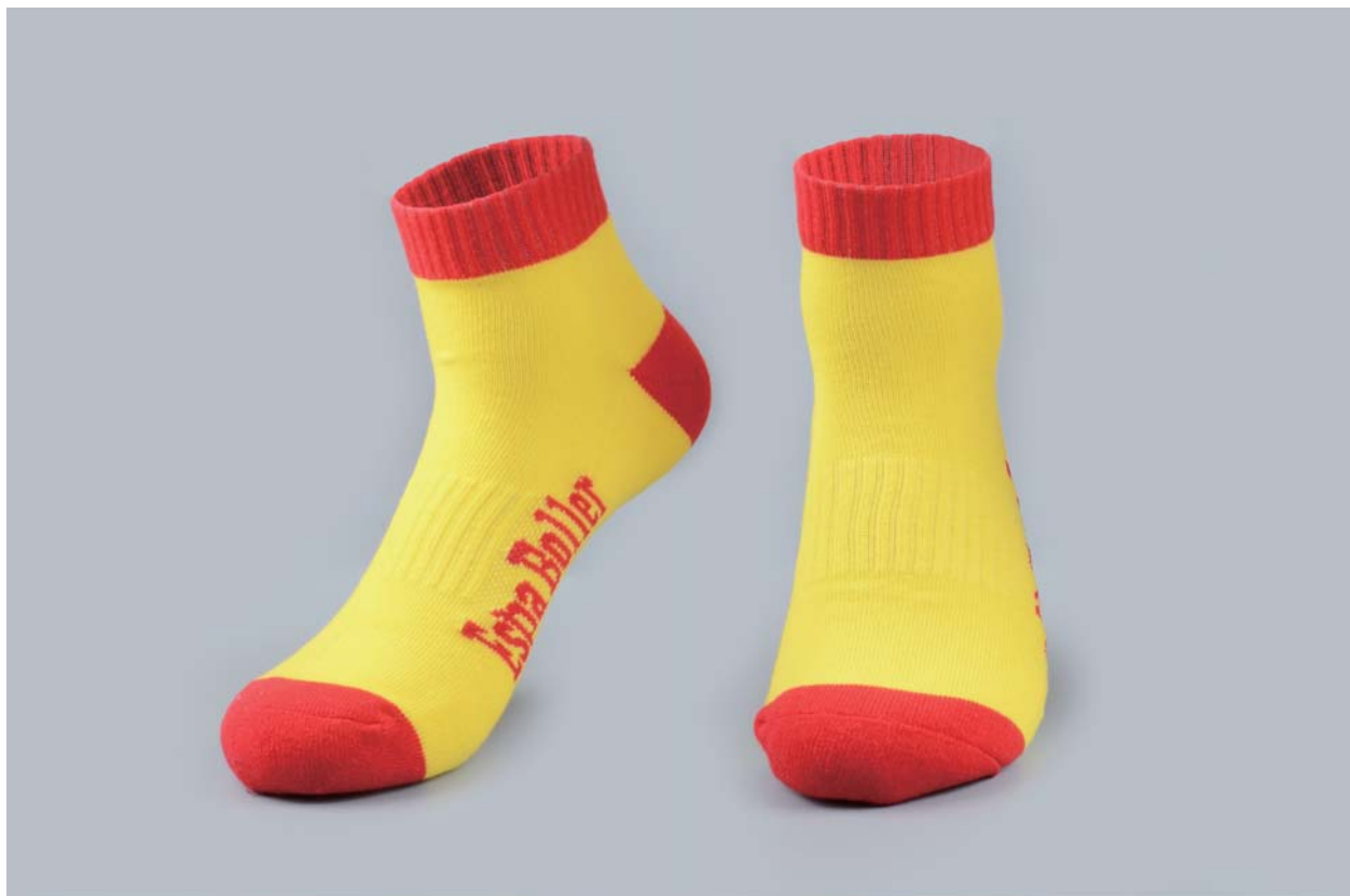
HJF-3573 Basic Ankle Socks

80% Cotton, 18% Nylon, 2% Elastane With jacquard logo 3 Size from S, M, L In own custom color and design Min. qty from 250 pairs Production time: 25 days